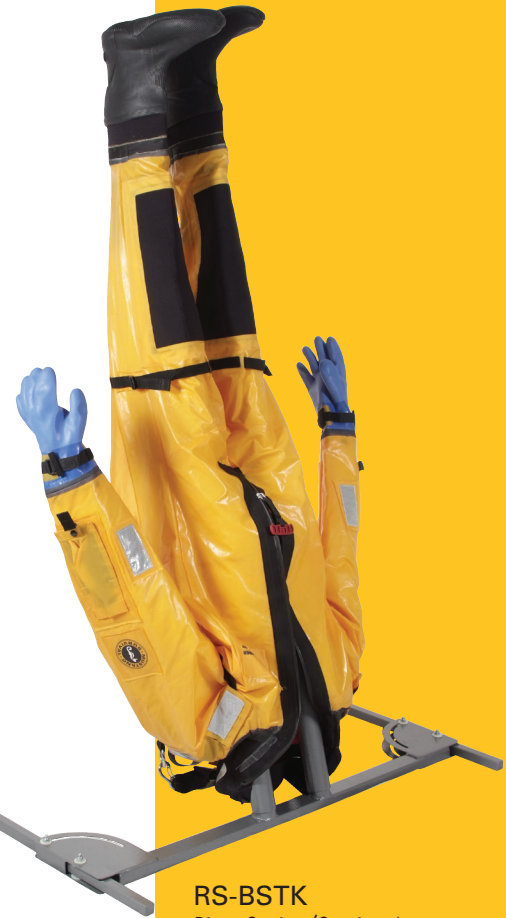
RS-BSTK Rinse Station/Staging Accessory Base and One Stickman