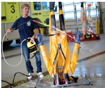
Securely holds gear in an upright position