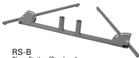
RS-B Rinse Station/Staging Accessory Base Only

The Ram Air rinse station and staging accessory securely holds stickmen from the gear dryer in an upright position for easily rinsing/decontaminating gear that cannot be washed in a mechanical washer. After cleaning, the dressed stickman are easily transferred to the gear dryer without further handling of the gear. This accessory can also be used to stage gear when gear drying needs exceed the capacity of the gear dryer. Its compact design folds easily for convenient storage when not in use. The rinse station can be order as a base only or as a package that includes both the base and one stickman. Additional stickmen can also be ordered separately.