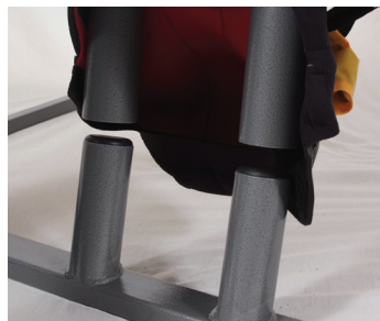
Teflon sliders for easy set-up