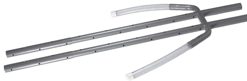
STK Stickman Only