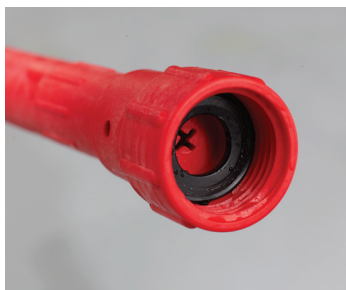
Air injection at nozzle