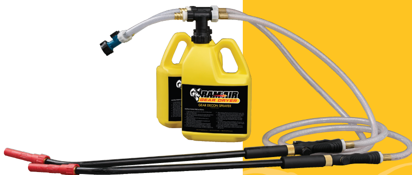
DECON-2 Dual-jug Gear Decon Sprayer