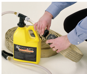
Fire hose adapter

For more information or to order, please contact your authorized Ram Air dealer today!