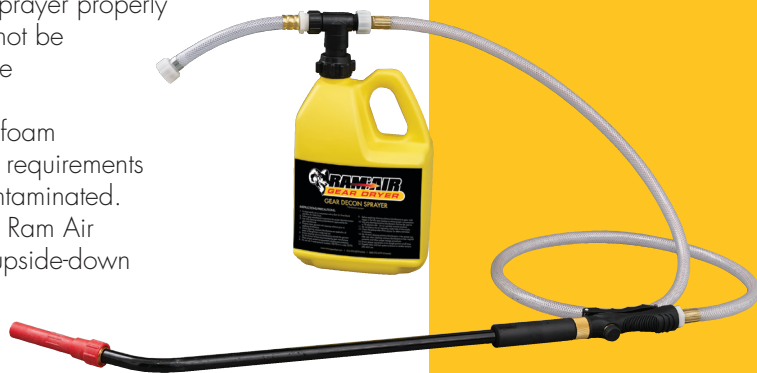
DECON-1 Single-jug Gear Decon Sprayer